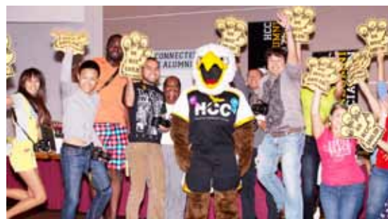
HCC mascot Swoop at West Loop Campus

HCC eagle mascot Swoop celebrated his first birthday in September 2012 at HCC Alumni Association event held on HCC’s West Loop and Spring Branch campuses.