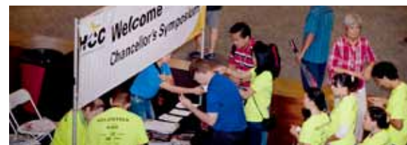
Houston-area students gather for a day of hands-on science at HCC event

The fourth annual Chancellor’s Symposium hosted 1,200 Houston-area middle and high school students who shared an interest in engineering. HCC Foundation employees joined volunteers at the event . The day of hands-on activity and informational sessions, co-sponsored by KBR, was held in September 2012 at NASA-Johnson Space Center and Space Center Houston.