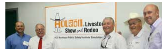
HLS&R funds new simulation lab for HCC

The Manufacturing Skills Summit , held in September 2012, was the first in a series of HCC summits to bring together industry leaders and educators. Discussion focused on ways to partner with industry to train the next generation of skilled workers. The event was made possible with seed funding provided by the HCC Foundation.