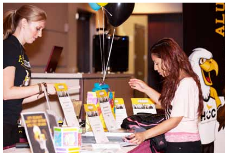
HCC students learn about scholarship opportunities—and also the importance of giving back to provide similar opportunities for future students—at Swoop’s first birthday at West Loop Campus

students learn more when they are actively involved in their education and have opportunities to think about and apply what they are learning in different settings.