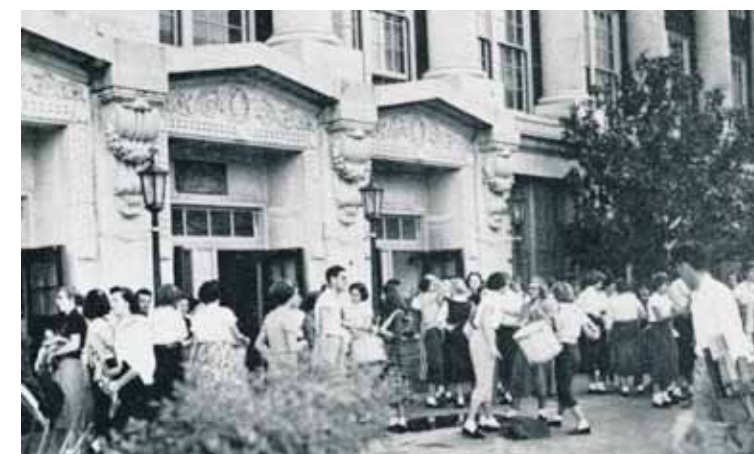
An early view of the San Jacinto Memorial Building now part of HCC Central College