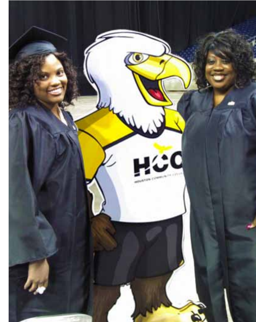
HCC graduates pause for a photo with HCC eagle mascot Swoop and learn how they can stay connected as part of the HCC Alumni Association

Even HCC students have found ways to support each other. This spring, Coleman College launched a student fundraising program in conjunction with Simulation Day, a day when the Coleman campus becomes a virtual hospital with hundreds of students participating in interdisciplinary simulated patient scenarios. While students prepared for "Sim Day" this year, each program also organized a student fundraising team to raise money for student scholarships and for future enhancements to their particular program. The inaugural effort gained traction among Coleman College's 20 health science fields with Surgical Technology students taking top place. Nearly 70 percent of students in this program reached out to family and friends—and even in their own pockets—to contribute to the first-time fundraiser.