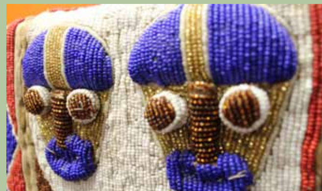
Detail work from fashions on display in the "Threads of AFRICA" exhibit at HCC Central Fashion Building