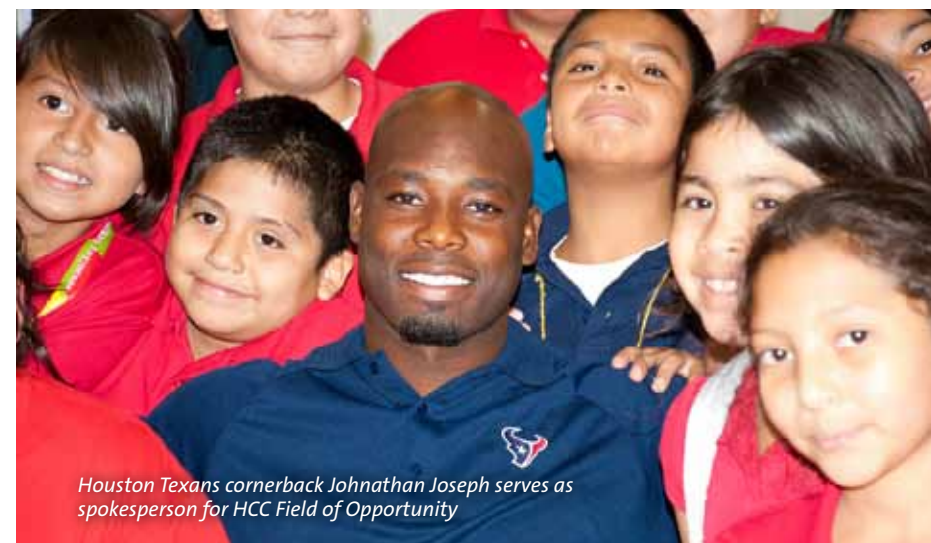
Houston Texans cornerback Johnathan Joseph serves as spokesperson for HCC Field of Opportunity

The HCC Foundation and the Houston Texans joined forces to launch the HCC Field of Opportunity Program in September 2012. In this program, each time the Texans score 14 points, an Opportunity 14 scholarship will be awarded. In addition, when the Texans hold an opponent below 14 points, an Opportunity 14 scholarship will also be awarded. The scholarships will be presented in both wins and losses – recognizing that with education there is always a winner.