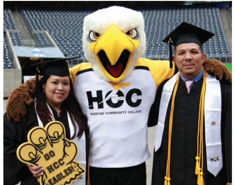
HCC graduates celebrate with HCC mascot, Swoop