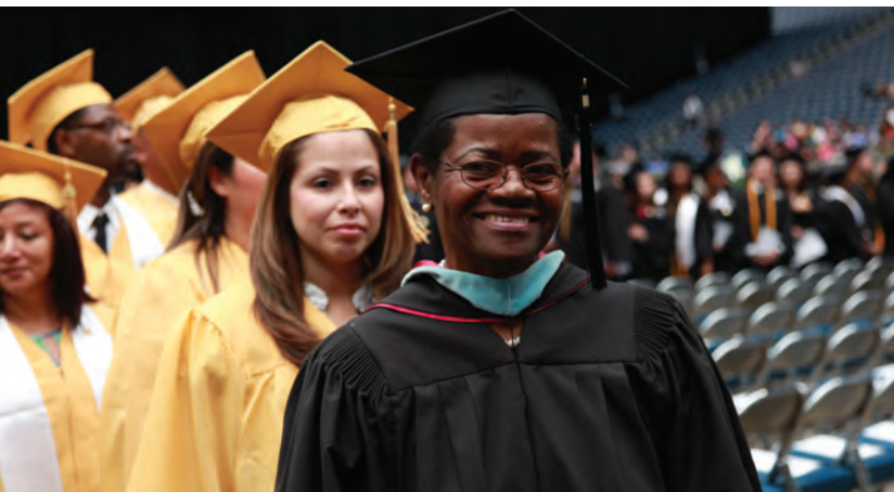
GED graduates (in yellow) line up for their walk across stage

To watch a video replay, view photo gallery and search list of HCC graduates, visit hccs.edu/district/students/graduation .