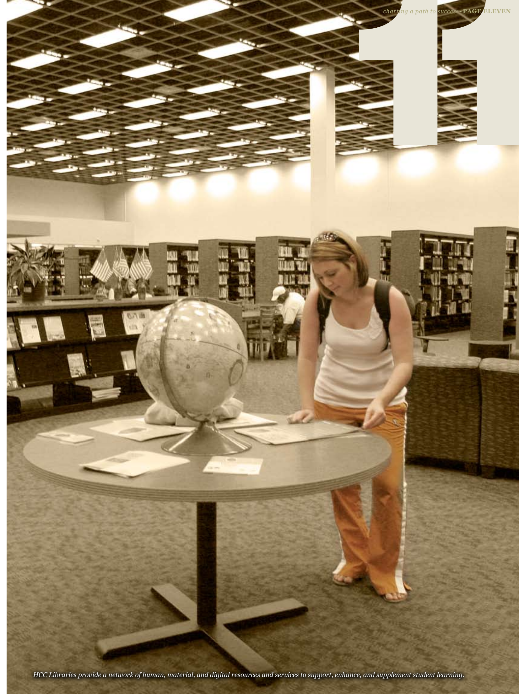
HCC Libraries provide a network of human, material, and digital resources and services to support, enhance, and supplement student learning.